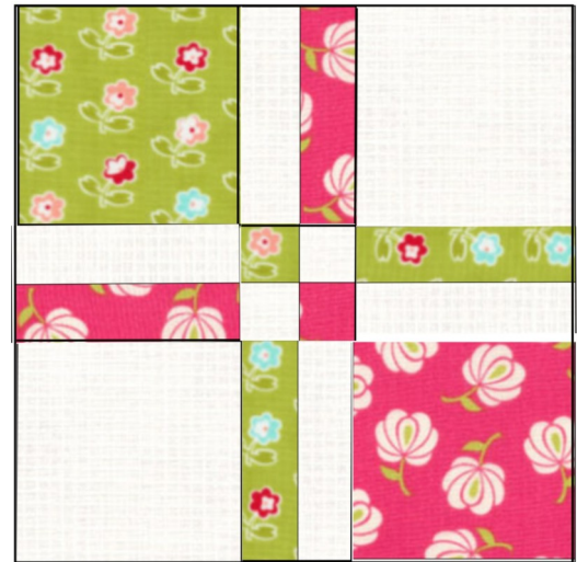
12 1/2" Unfinished Block